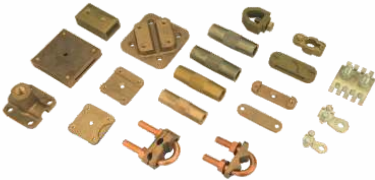
Earthing & Grounding Connections