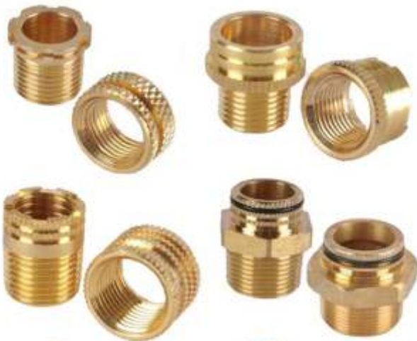
Brass CPVC Fitting Components