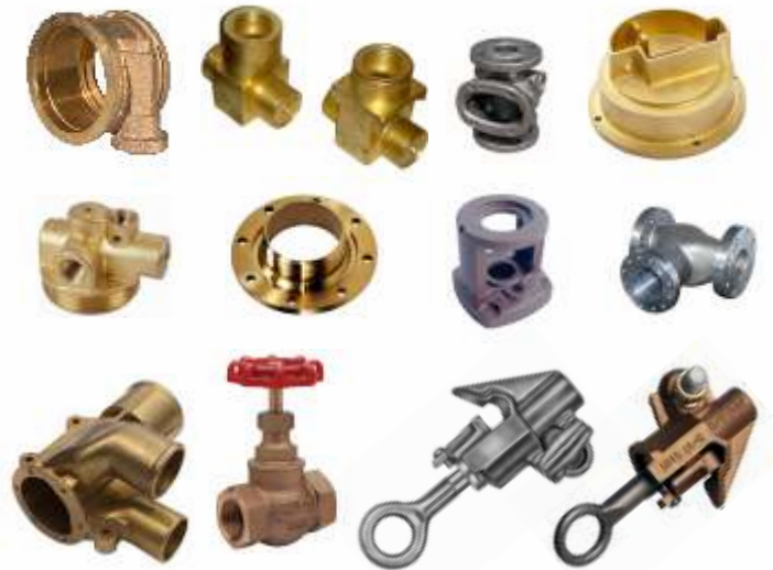
Casted & Machined Components