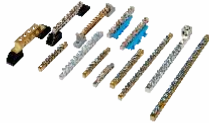
Brass & Aluminium Neutral Link