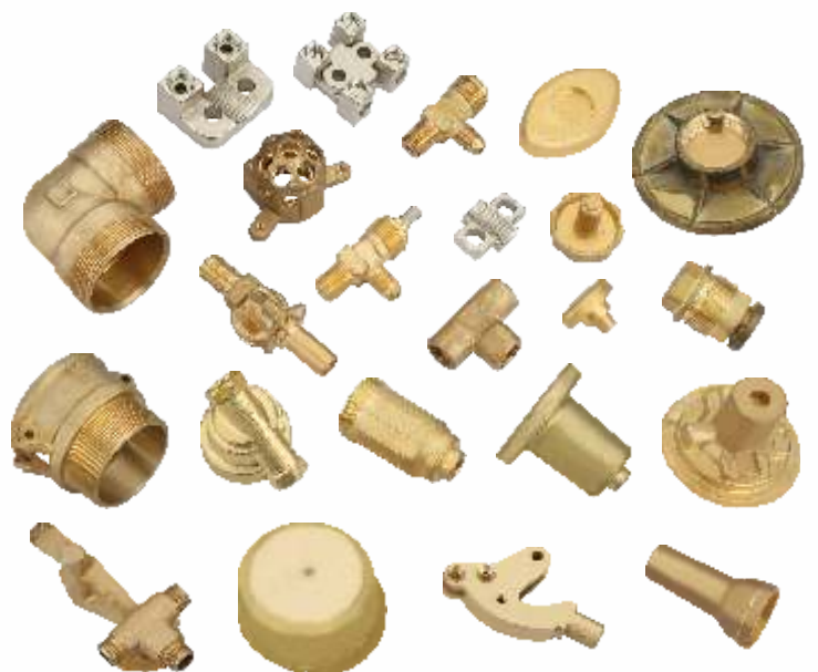
Forged & Machined Components