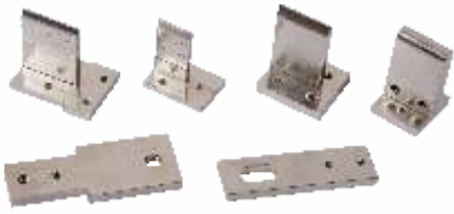
T & Extended Patti