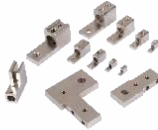
Lugs Type & Knife Type