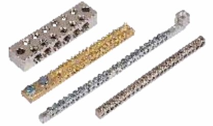
Brass Neutral Link