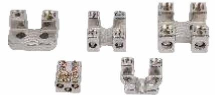
Line Tap Terminal