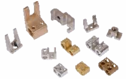
Phase & Neutral & Wedge Contact Terminal