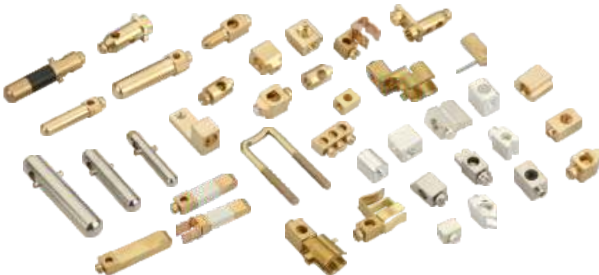
Plugs Sockets & Modular Switch Parts