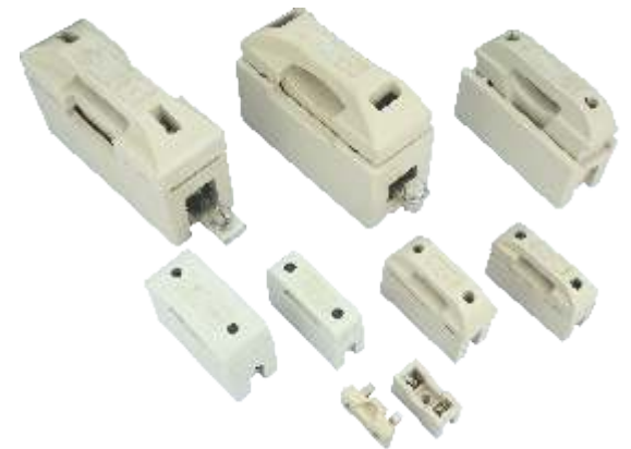
Kit Kat Fuse Unit