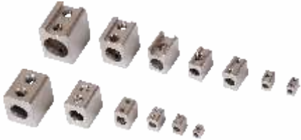
Kit Kat Fuse Part